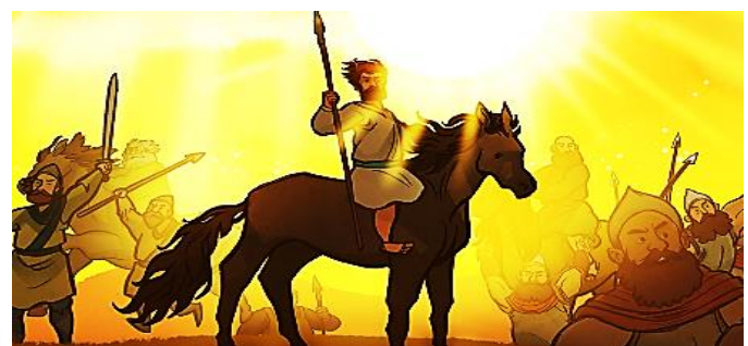
Joshua 10-Sun Stand Still