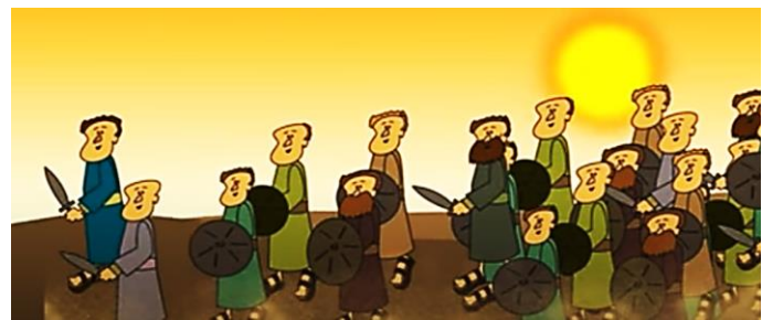
Sun Stands Still